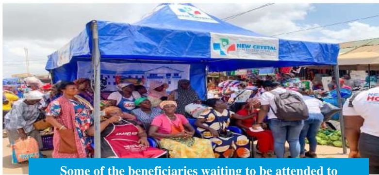
Some of the beneficiaries waiting to be attended to

The campaign is a community-wide initiative, aimed at fighting Non-Communicable Diseases (NCDs) as well as improving health access for the residents of Ashaiman. It is expected that all the seven (7) zonal councils within the Ashaiman municipality would be fully covered within the stipulated date.