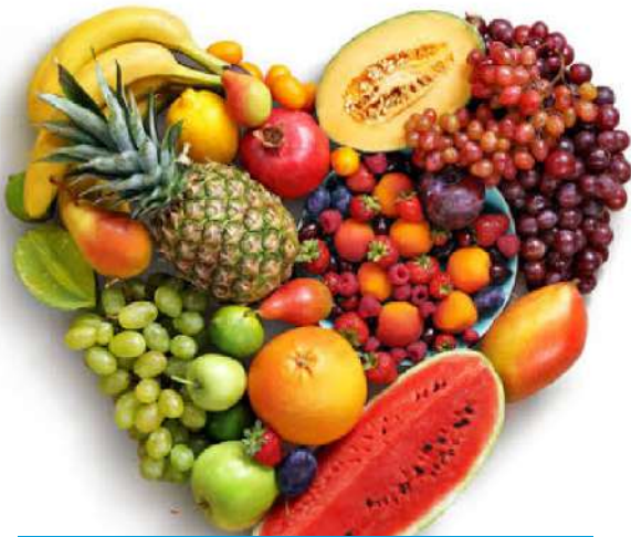
Fresh fruits and vegetables should be part of your daily meals