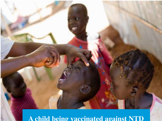
A child being vaccinated against NTD

The exercise is being rolled out by the Ghana Health Service (GHS).