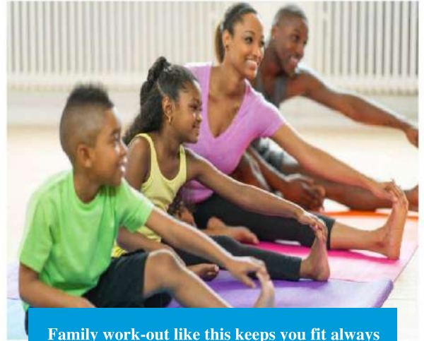
Family work-out like this keeps you fit always

Experts also advise that we eat a variety of healthy regular meals and limit calories, added sugar and saturated fat; staying physically active; having enough rest; keeping our blood pressure and cholesterol levels in a healthy range as well as avoiding unhealthy behaviours like smoking and alcohol consumption.