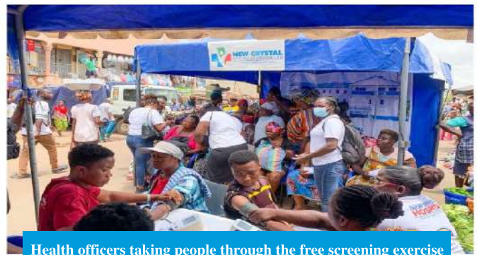
Health officers taking people through the free screening exercise